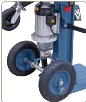
Large rubber wheels allow for easy transport (HS 16 E).