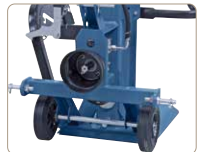
Serially with three-point attachment according to cat I/II and pins