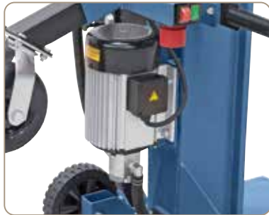
Powerful electro motor and high quality hydraulic pump.